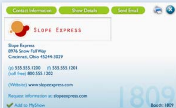
Included in SIA Exhibitor Space Fees